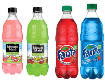
20oz CSD (MM & Fanta Flavors only) 2 for $4.00 Or 1 @ Regular Price