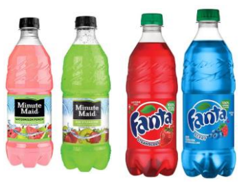
20oz CSD (MM & Fanta Flavors only) 2 for $4.00 Or 1 @ Regular Price