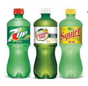
7-Up and Flavors 20oz Bottles 2/$4.25 Or 1 @ Regular Price