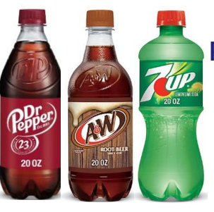
Pepper and Flavors 20oz Bottles 2/$4.25 Or 1 @ Regular Price