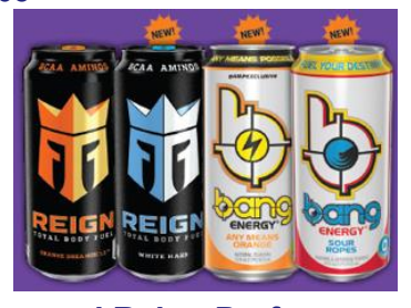
Bang and Reign Performance 16oz 2 for $5.00 or