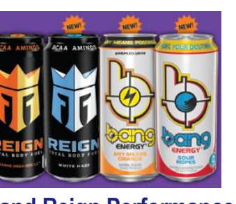
Bang and Reign Performance 16oz 2 for $5.00 or