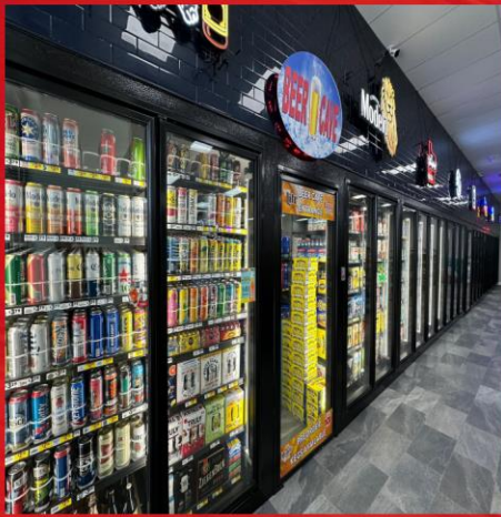
WALK IN Coolers