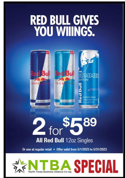
Poster / Window Sign