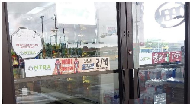
Front Door Striker (goes on store front doors , not on coolers or vault)