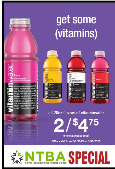
Poster / Window Sign