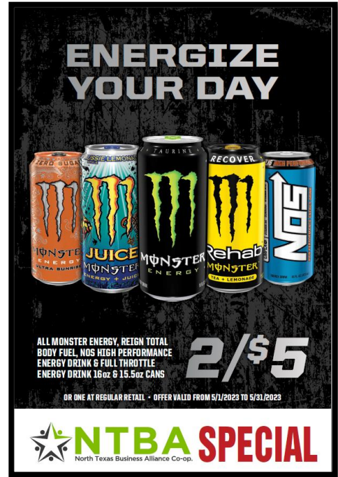
Poster / Window Sign